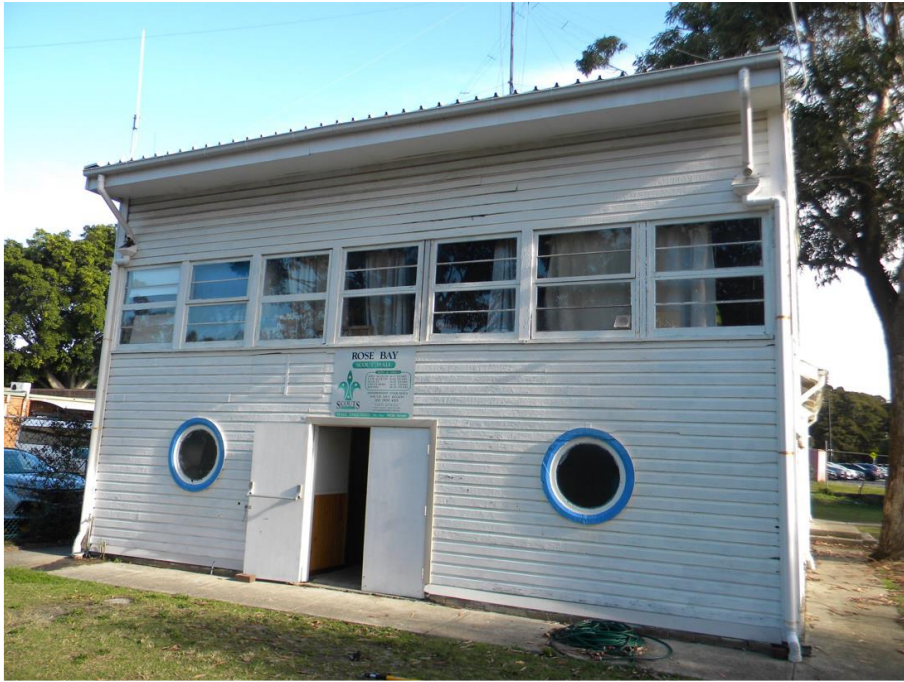
Figure 1: Rose Bay Scout Hall, front (north-eastern) elevation (WP Heritage and Planning)