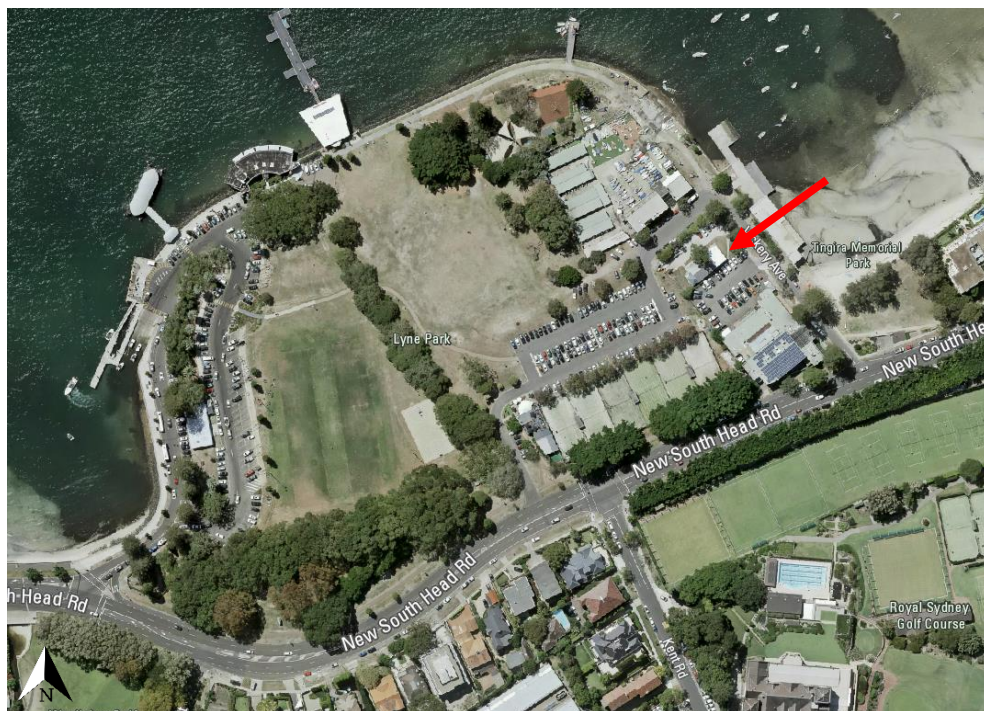
Figure 2: Site location. The arrow points to the site (Woollahra Council GIS)