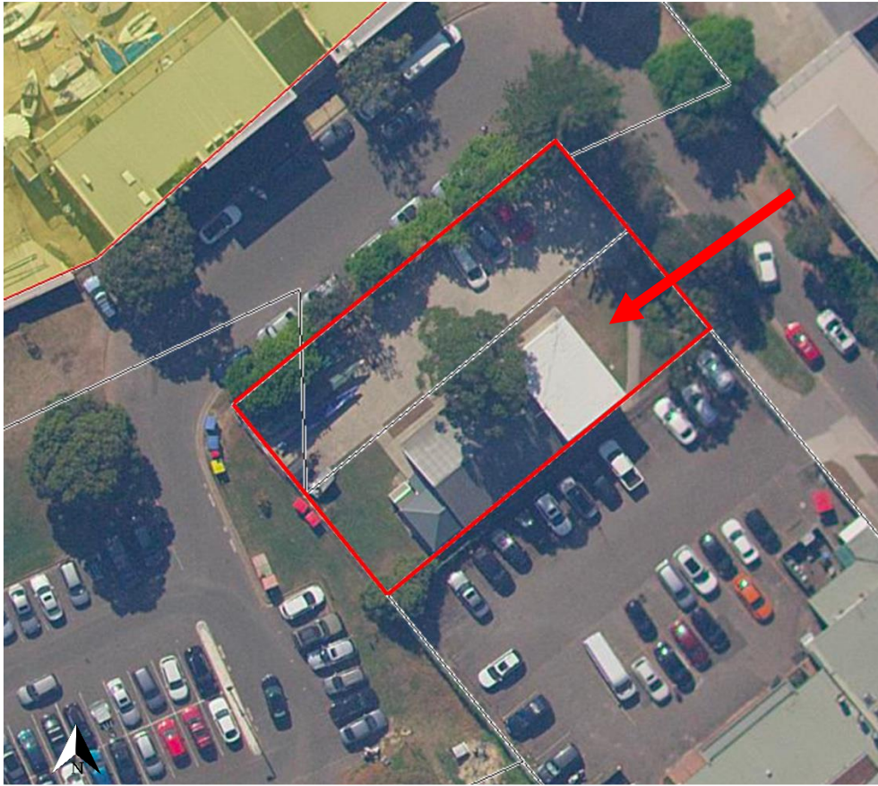
Figure 3: Aerial photograph over the site with Scout Hall indicated by arrow (SIX Maps; annotation by WP Heritage and Planning)